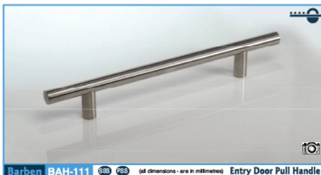
Barben BAH-111 SSS PPS (all dimensions - are in millimetres) Entry Door Pull Handle