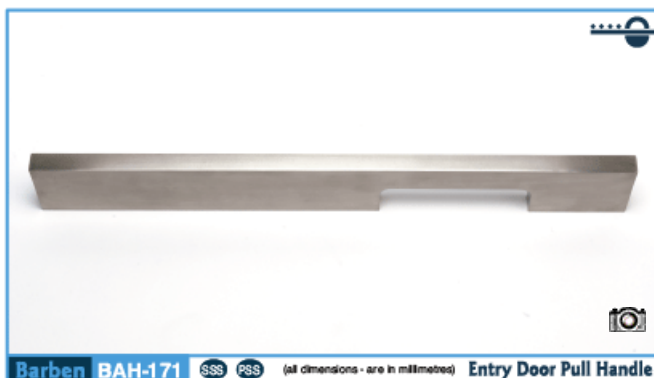
Barben BAH-171 SSS (all dimensions - are in millimetres) Entry Door Pull Handle