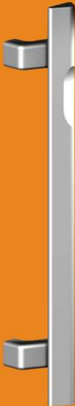
Delta 622 on offset pillars