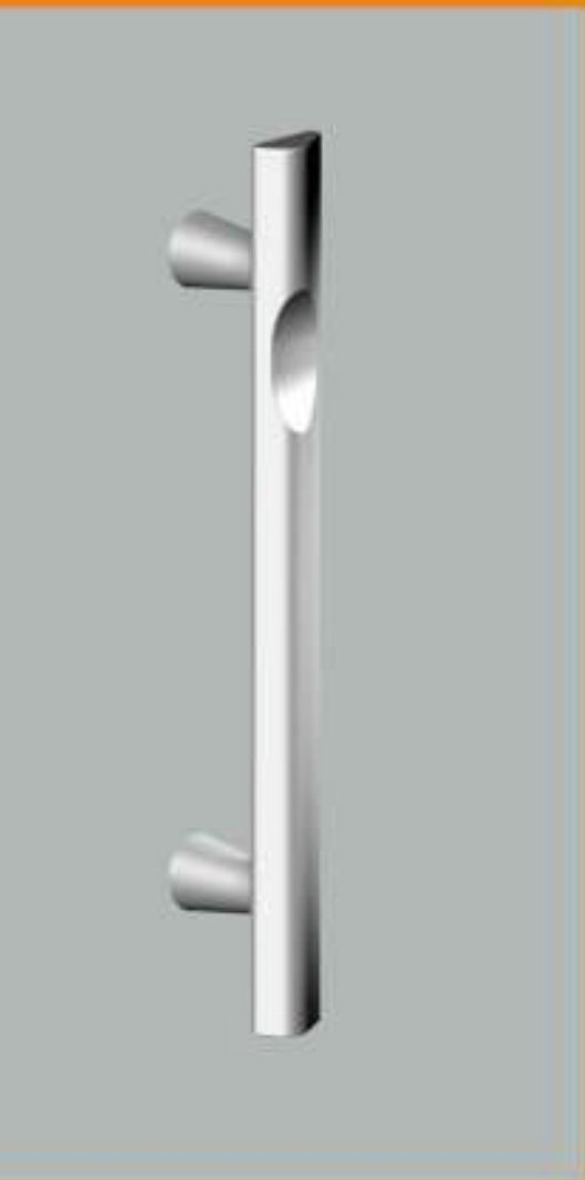
Delta 623 on standard pillars