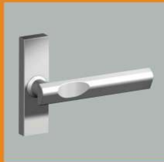
Delta 631 on A1-10 Plate